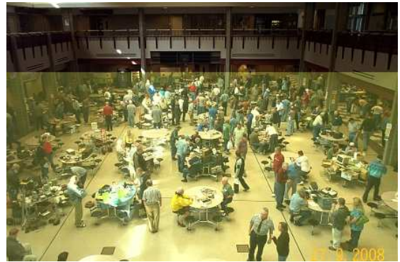
2008 Spokane Hamfest.

(Pacific Time) Weekdays 5:45AM Weather Net 4:45PM Weather N Monday 8:00PM YL Net Tuesday 8:00PM Youth Net Sunday 10:00PM Astronomy Net