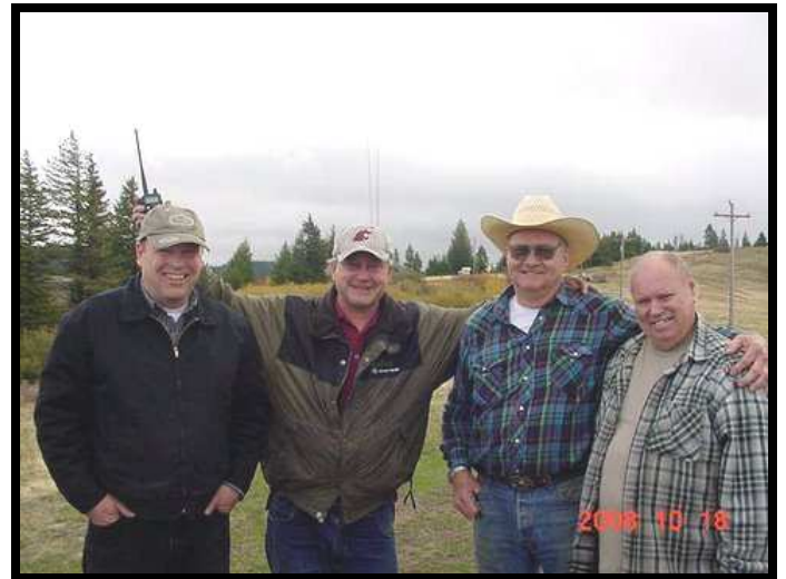
Work at Pikes Peak Repeater??