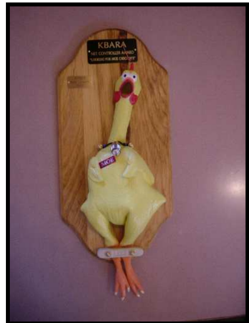
Moe-Checkin Net Controller Award "Looking for Moe Checkin's" Where will Moe land next??